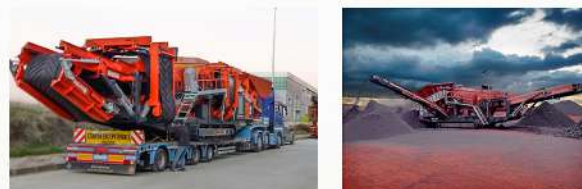
EASY TO TRANSPORT DUE TO FOLDABILITY

CAN EASILY BE COMBINED WITH OTHER BORATAS MOBILE MACHINES AS TANDEM WORKING.