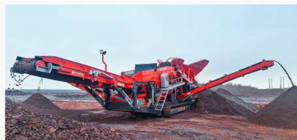
PROVIDES 3 DIFFERENT END-PRODUCTS WITH PRECISE DIMENSIONS BY 2-DECK SCREEN