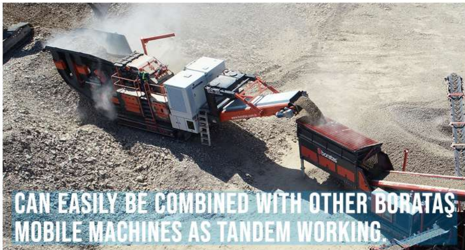
CAN EASILY BE COMBINED WITH OTHER BORATAS MOBILE MACHINES AS TANDEM WORKING