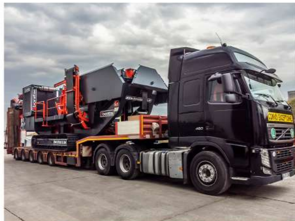
EASY TO TRANSPORT DUE TO FOLDABILITY