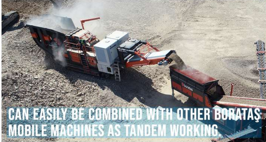
CAN EASILY BE COMBINED WITH OTHER BORATAS MOBILE MACHINES AS TANDEM WORKING