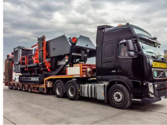
EASY TO TRANSPORT DUE TO FOLDABILITY